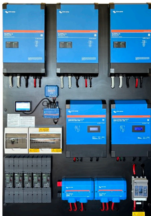
Example of Board mounted option

While the cabinet option has a larger upfront cost, it will extend the life of the system, allowing for greater long-term savings. The board mounted option, can provide opportunity for vermin, dust, water and more to cause unnecessary damage to the system.